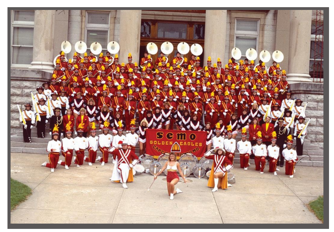
Golden Eagles Marching Band.

So what else did students do for fun? In the 1950s, there was a social life committee for the college, consisting of both students and faculty. The committee set the social calendar for the year, scheduling the Fall Frolic, Sagamore Christmas Ball, Spring Dance, and Saturday night dances. In 1951, campus welcomed the first Greek social organizations—the Delta Kappa fraternity and Sigma Sigma Sigma sorority. By 1960, Southeast housed ten social societies; today there are more than two dozen.